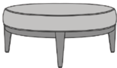
MASOTTA0 36W 36D 18H