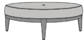
MASOTTB1 42W 42D 18H