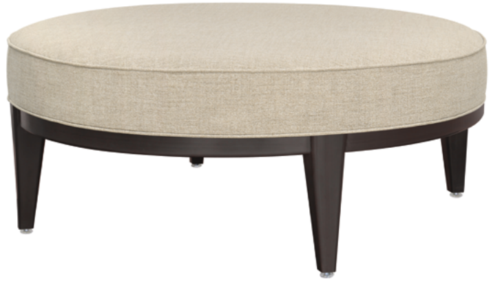
Model: MASOTTB0 42W 42D 18H

Add a level of sophistication to a common area or lounge with the Masera Ottoman. Fully upholstered, with piping detail, this ottoman is available in two sizes. It is also offered with or without the tufted center button.